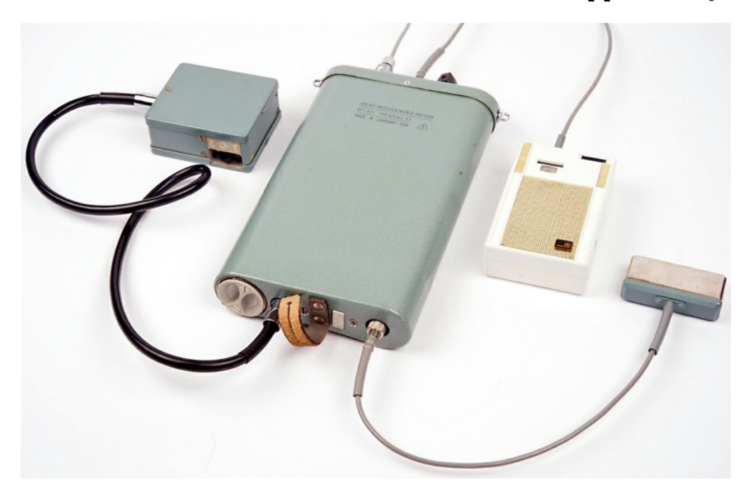
UFT-421 Country of origin: GDR