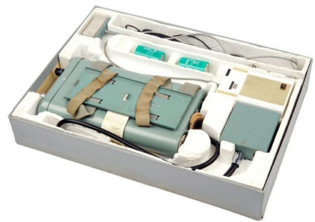
Shipping/storage box with a complete UFT-421 excluding the battery charger.

The UFT-421 was a body wearable fully transistorised VHF FM transceiver produced by VEB RFT Messtechnik, Dresden in the GDR during the late 1960s and well into the 1970s, until succeeded by the much smaller Czechoslovakian Tesla PR-35 'Faun' in 1977. (See Chapter 120). The UTF-421 was produced in two versions differing only in frequency coverage: 66-88 MHz and 146-174 MHz. It was primarily used for covert operations and surveillance by the Stasi. With its slightly curved shape the set could be worn inconspicuously hidden under the clothes on the body using a bracket with elastic straps. A cable, usually running through the operator's sleeve, connected the radio to a remote control unit carried in the hand of the operator. The loudspeaker/microphone was concealed in the housing of a commonly used commercial broadcast transistor radio.