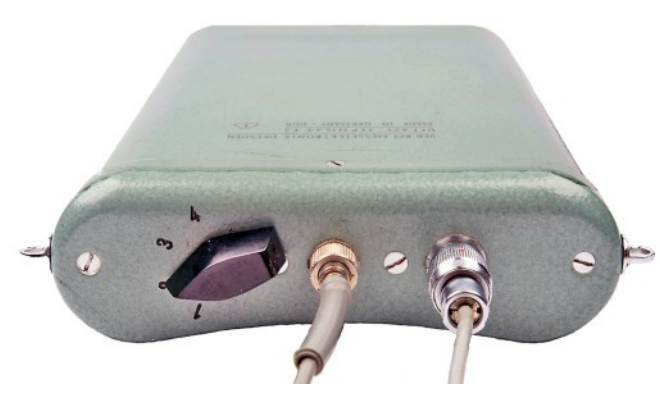
Top panel of the main unit, showing channel selector, microphone/speaker connection and aerial socket.

Accessories: Remote control unit with cable, vibrator unit, loudspeaker/microphone, dipole wire aerial, rod aerial, carrying bracket, two rechargeable batteries.